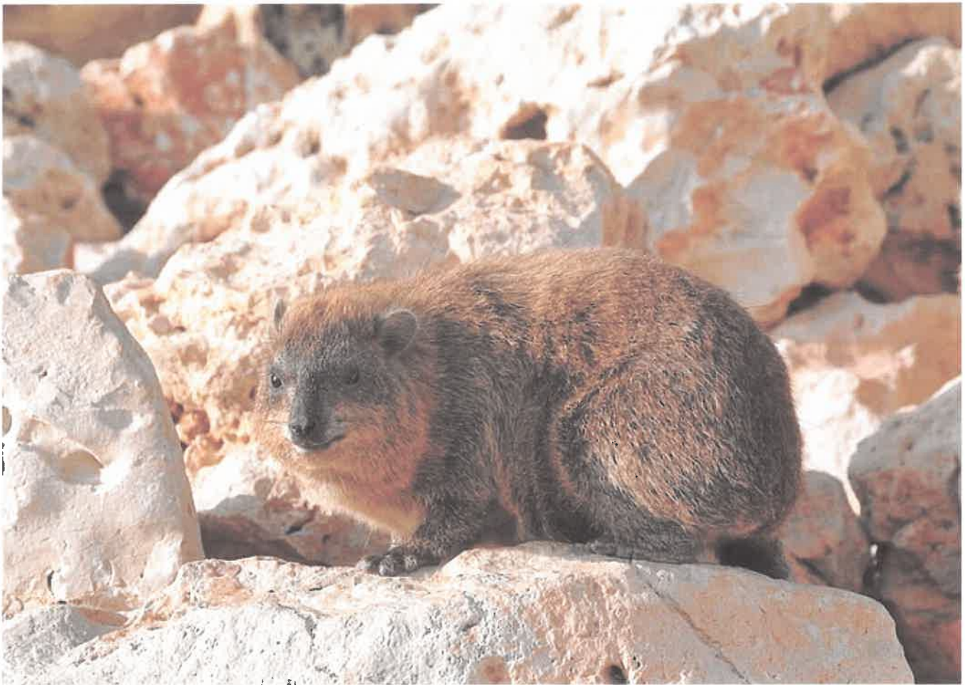
An Israeli Coney - Found In The Rocks Of Mountains and Canyons

foot. That is a long way from $20K per sq. ft. You will find out why the structure cost so much as we go along.